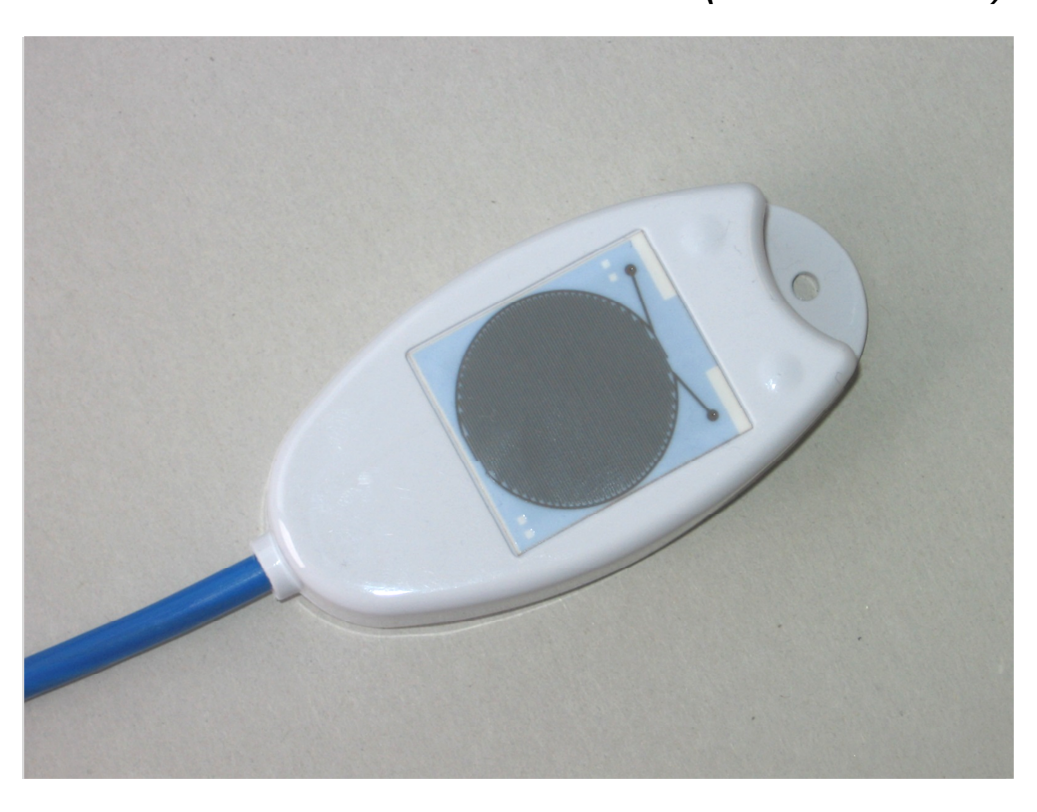
MANUAL FOR INSTALLATION AND USE